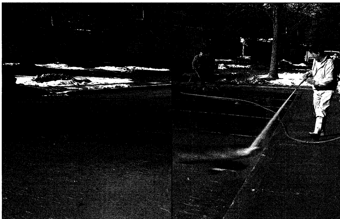
L.: Foxwood Manor Apartments' parking lot turns into a lake after break in their water main occurs. R.: LBCJMA workers shown cleaning up.